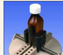
Optional Sample Gripping Jaws.