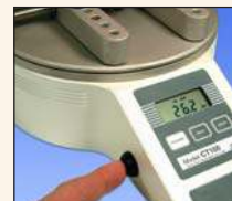
Optional Data Output Package.