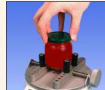
Simple Hand Operation.